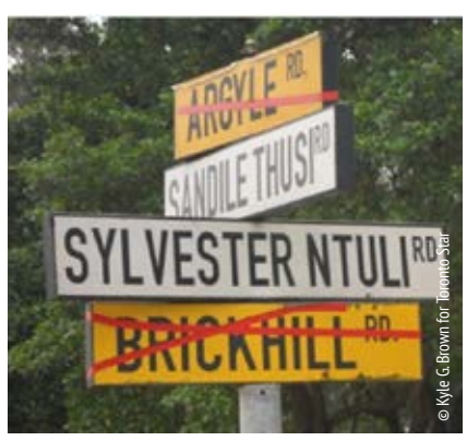
Street signs in Durban show changing preferences, while (left) Nigerian newspapers debated nationalist politics

The tension between traditional and modern ideas is also a theme of Wale's other main area of research – the role of the Nigerian Press in nationalist and ethnic politics. 'Since the 1990s I've been building a private archive of 20th century newspaper articles and looking at the intellectual leadership of newspaper proprietors and journalists in attempting to reconcile the principles of the European Enlightenment with emerging African colonial modernity,' says Wale. 'There's